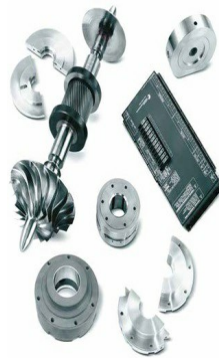
MSG® TURBO- AIR®