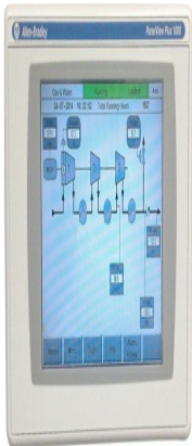
Sistema de control