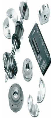
Piezas de repuesto de