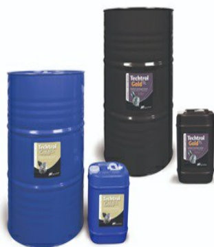
Tectrol Gold Centrifugal Compressor Lubricant