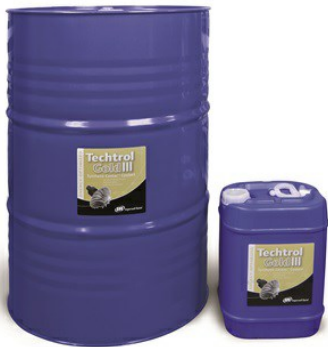
Techtrol Gold Centrifugal Compressor Lubricant