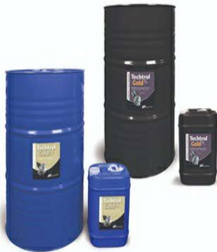
Techtrol Gold Centrifugal Compressor Lubricant