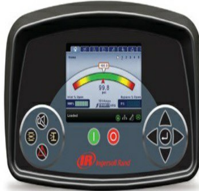
Xe-145F Series Centrifugal Compressor Controller