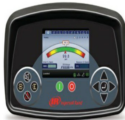
Xe-145F Series Centrifugal Compressor Controller