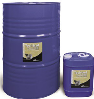
Techtrol Gold Centrifugal Compressor Lubricant