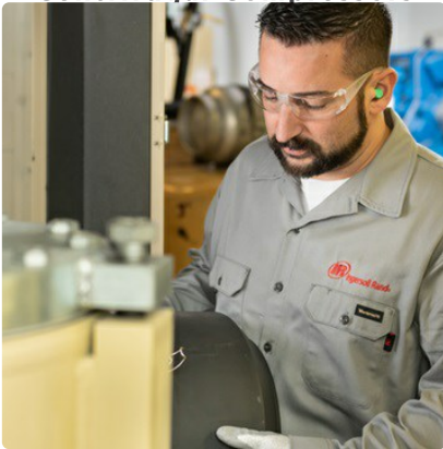
Field Overhaul Services