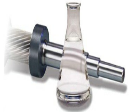
TurboBlend™ 46 Premium Centrifugal Compressor