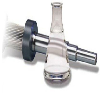
TurboBlend™ 46 Premium Centrifugal Compressor