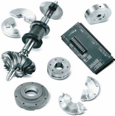
MSG® Centrifugal Compressor Replacement Parts