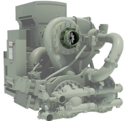
Upgrade - Variable Inlet Guide Vanes for Centrifugal Compressors