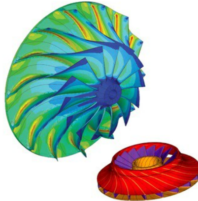
Upgrade - Aerodynamic Enhancements for Centrifugal Compressors