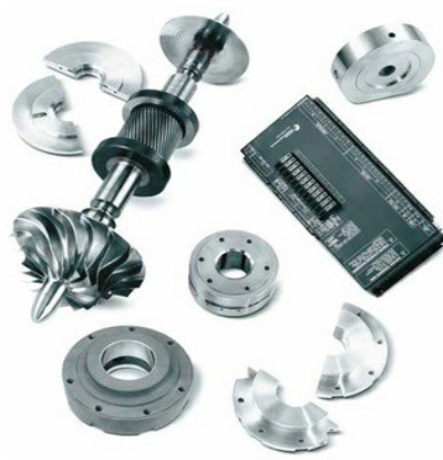
Pièces de rechange pour compresseurs centrifuges