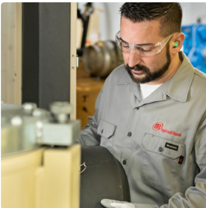
Field Overhaul Services