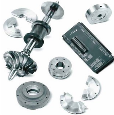
MSG® Centrifugal Compressor Replacement Parts