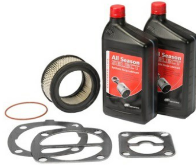
Small Reciprocating Maintenance Kits