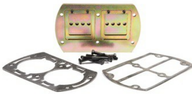
Small Reciprocating Valve Kits