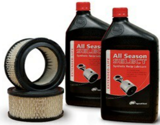
Small Reciprocating Start-Up Kits