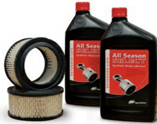
Small Reciprocating Start-Up Kits