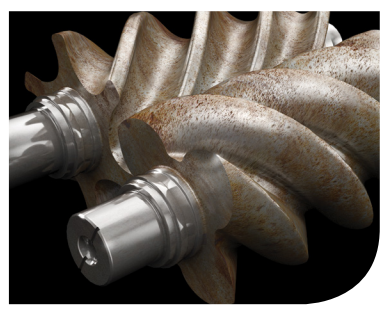
Rotors with conventional lubricant

Synthetic lubricants are better for the environment, last longer, are less expensive and are less prone to contamination and varnishing. Our family of synthetic lubricants are specifically designed to help rotary screw compressors maintain peak performance.