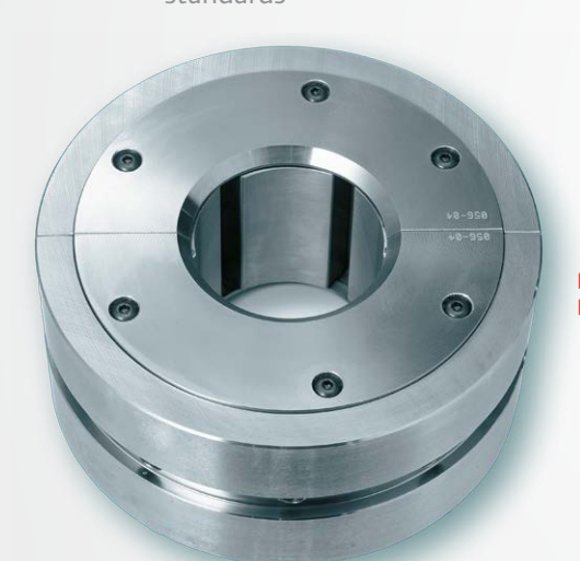
Five-pad Tilting Pad Bearing Assembly