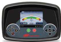
Xe-145F Series Centrifugal Compressor Controller