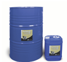
Tectrol Gold Centrifugal Compressor Lubricant