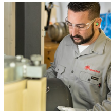
Field Overhaul Services