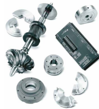
MSG® Centac® Centrifugal Compressor Replacement Parts