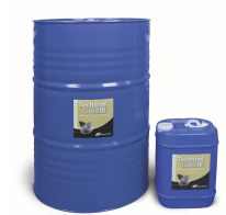
Tectrol Gold Centrifugal Compressor Lubricant