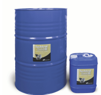
Tectrol Gold Centrifugal Compressor Lubricant