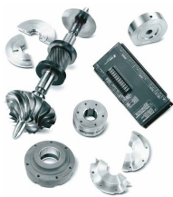
MSG® Centac® Centrifugal Compressor Replacement Parts