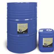
Tectrol Gold Centrifugal Compressor Lubricant