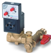
Electronic Drain Valves