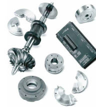
MSG TURBO-AIR Centrifugal Compressor Replacement Parts