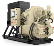
MSG® TURBO-AIR® NX 8000 Centrifugal Air Compressor