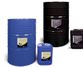
Tectrol Gold Centrifugal Compressor Lubricant