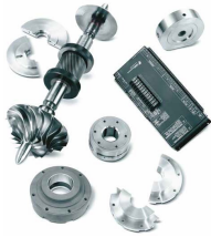
MSG® Centac® Centrifugal Compressor Replacement Parts