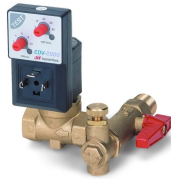
Electronic Drain Valves