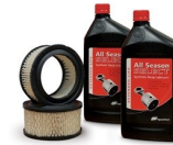
Small Reciprocating Start-Up Kits