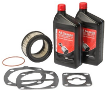
Small Reciprocating Maintenance Kits