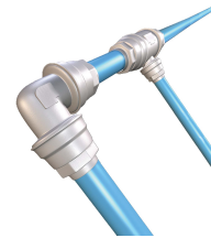
SimplAir Compressed Air Piping