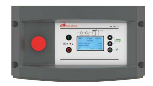
The Xe-Pro Series controller can be ergonomically positioned on top or in front of the compressor.

The Xe-Pro SE Series control system ensures reliable operation and protects your investment by continuously monitoring operational parameters. Stay connected with the Xe-Pro 75 using the-easy-to-use display or via remote access from a web browser or smartphone. A sequencer option is also available, allowing a master Xe-Pro 75 to control up to 3 additional units of similar size. For even more control, choose the optional Helix™ Connected Platform that gives you real-time insights to keep your compressor operating at peak performance.