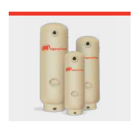
Air System Accessories

Get the exact genuine OEM parts you need, when you need them, from our locations around the world.