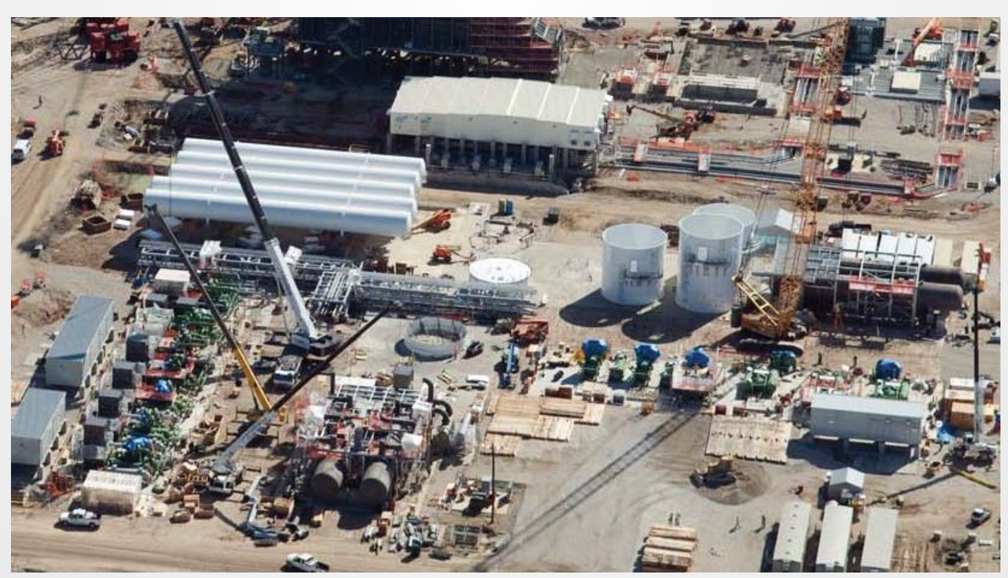
Work site for construction of an IGCC power plant in the US. Ingersoll Rand field service technicians were on site to coordinate the installation and commissi of thirteen MSG-16 compressors.