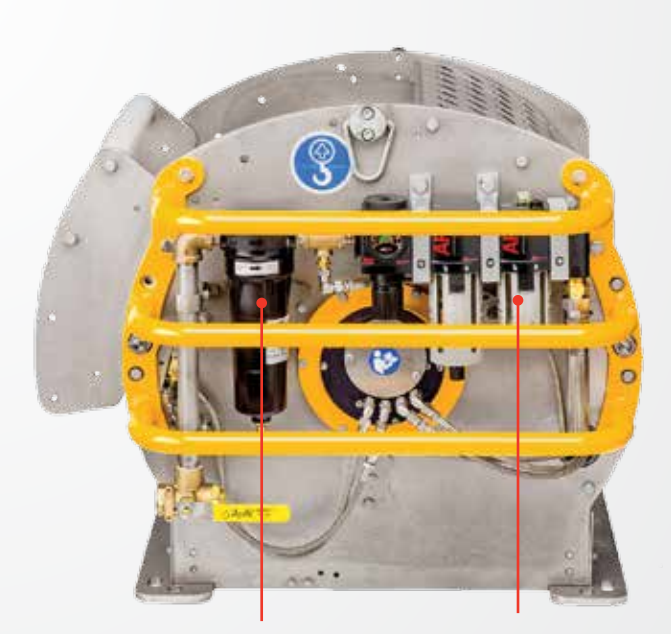
Integrated Water Separator helps protect the motor from moisture