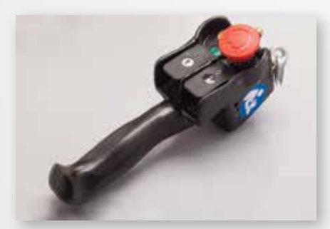
Remote Pilot Pendant

Ergonomic pilot pendant provides remote raising, lowering and emergency stop features.