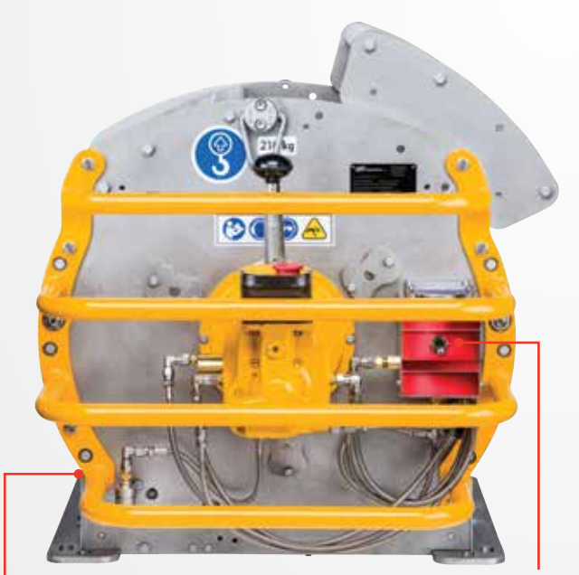
Automatic Multi-Disc Brake and Automatic Drum Brake provide the safety of redundant braking systems

around the world in the most extreme environments. This experience is built into every Man Rider winch we sell. Trust Ingersoll Rand MR150 Man Rider winches to help you protect your most important asset, your people.