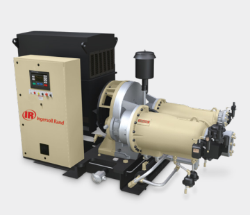
MSG CENTAC C400