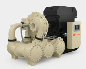
MSG CENTAC C1000