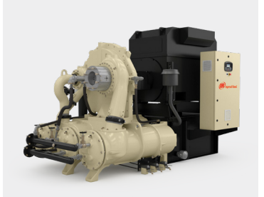
MSG CENTAC C800

Inefficiencies, contaminants and breakdowns result in costly downtime, product liability or damage to your brand reputation. MSG Centac centrifugal compressors help eliminate these problems, while reducing total lifecycle costs.