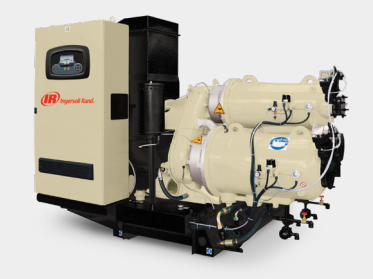
MSG CENTAC C700