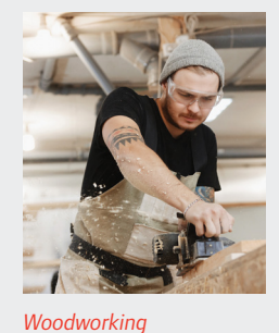
Sawing, clamping, hoisting, actuation & controls, pressure treatment

Powering impact guns, ratchets, grinders, drills, nailers, paint sprayers, sanders and more