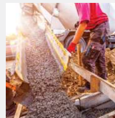
Cement & Construction