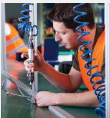
Manufacturing & Assembly

Ingersoll Rand offers a wide portfolio of reliable products that will adapt to your industry and application. We will assess and propose the best solution to lower the total cost of ownership of your compressed air system, maximizing the productivity of your operation.