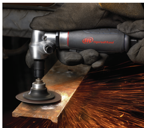
GRINDING AND DESCALING