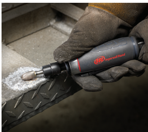
BLENDING AND DEBURRING