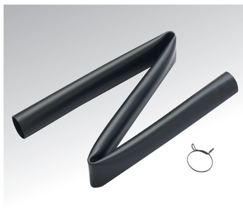
PIPED AWAY EXHAUST KIT INCLUDED