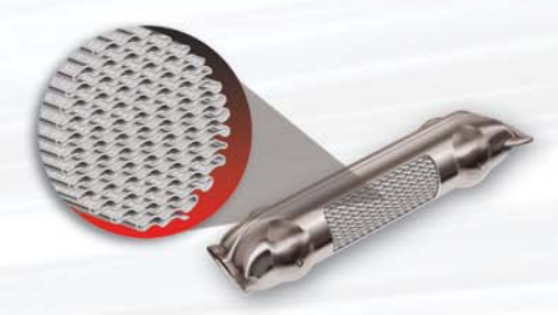
The heat exchanger features a unique corrugated stainless steel panel to help ensure reliability.

High pressure cycling refrigerated dryers are highly efficient, providing dry, clean air under any operating conditions.