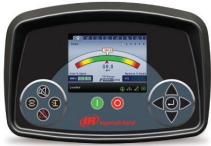
Xe-145F Series Centrifugal Compressor Controller